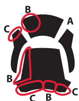
Chan Centre Orchestra Level Dress Level