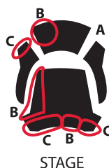
Chan Centre Orchestra