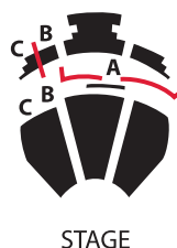
Vancouver Playhouse Orchestra and Balcony Levels